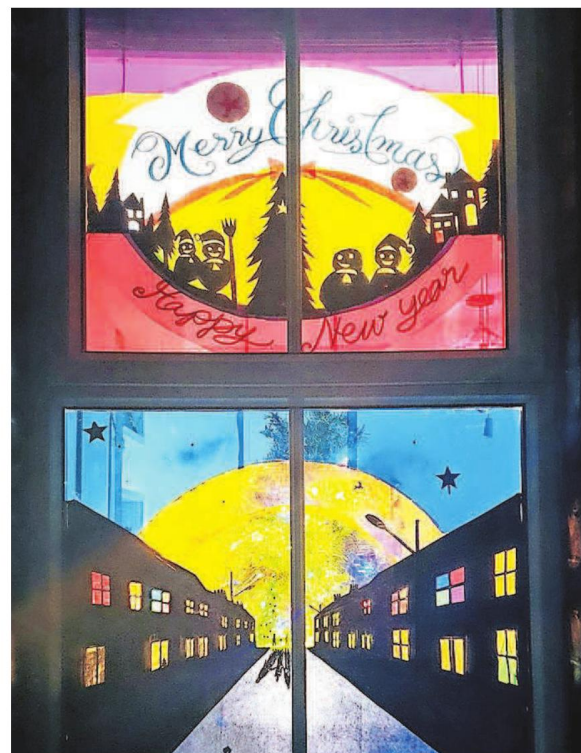
Christmas display in Cavendish Road, Harpenden.