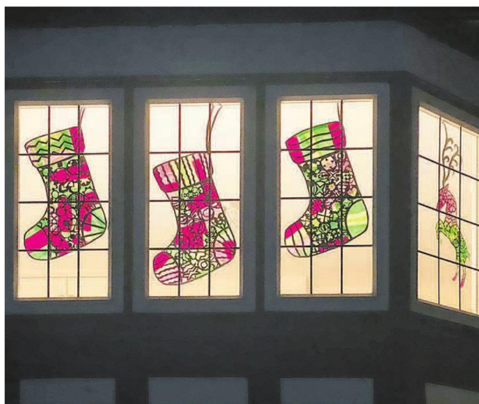
Christmas display in Bowers Way, Harpenden. P